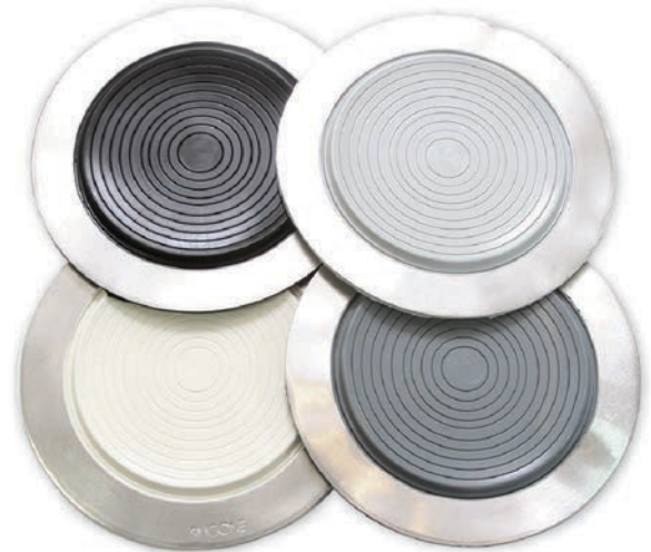
FDA White High Temp Silicone