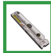
chalk line or laser