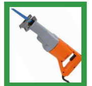
Sawzall to trim excess length of rail

(See step-by-step instructions on reverse.)