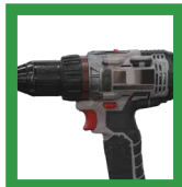
Industrial grade screwgun