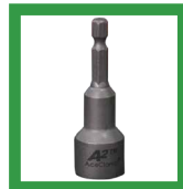
9/16" hex socket & adaptor for screwgun