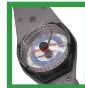
Dial indicator torque wrench